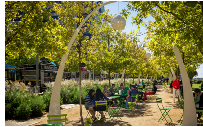
FILE NAME KlydeWarrenPark_Dallas_006 CAPTION Food trucks - which were originally temporary food options while the restaurant was under construction - have become so popular that they have become a permanent feature. Groves of trees help buffer the park from the busy city streets.