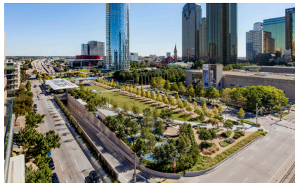
FILE NAME KlydeWarrenPark_Dallas_004 CAPTION The park has numerous environmental benefits, including the sequestration of an estimated 18,500 pounds of carbon annually, interception of 64,000 gallons of stormwater runoff and a marked reduction in temperature, air pollution and noise.