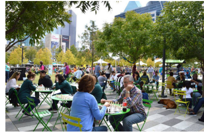
FILE NAME KlydeWarrenPark_Dallas_007 CAPTION The park's reading and games room is monitored by docents who manage the collector of chess, checkers, and other board games available for free to use by the public.