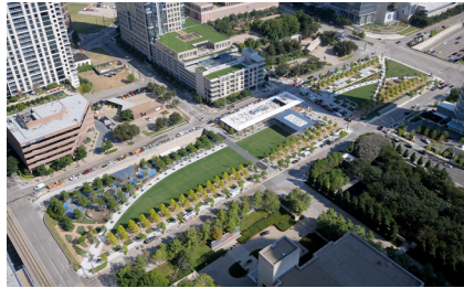
FILE NAME KlydeWarrenPark_Dallas_002 CAPTION Built over an existing freeway, Klyde Warren Park provides a variety of flexible outdoor rooms that support a diverse range of free programmed activities. Since opening in October 2012, the park has been enthusiastically adopted by the citizens of Dallas.