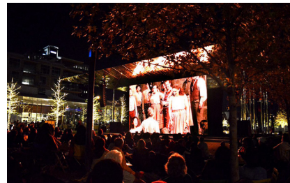
FILE NAME KlydeWarrenPark_Dallas_008 CAPTION The heart of Klyde Warren Park is a 40,000 square foot great lawn with a performance pavilion designed to accommodate a full symphony orchestra.