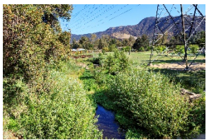
05 – Restored Little Tujunga Wash with water and new stream planting adjacent to large urban infrastructure. One of the replacement pedestrian bridges is in the background.