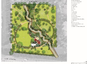
01 – Site Plan