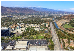
02 – Aerial of Johnny Carson Park in lower middle shows adjacency to the 134 Freeway and Los Angeles River to the right (south) of the park, and urban development on the other sides.