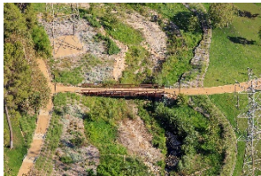
04 – Aerial image of a section of the restored Little Tujunga Wash with one of the replacement pedestrian bridges shows how the natural stream wash abuts open fields.