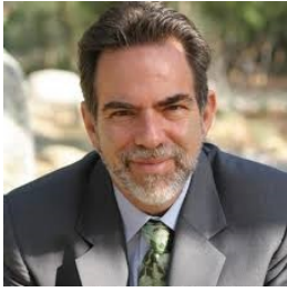
Andy Lipkis, Founder of TreePeople

For decades, Andy Lipkis has been a visionary force advocating for the power of natural systems and green infrastructure to heal the urban environment and achieve a sustainable future. Andy's efforts have been instrumental in educating and activating landscape architects to better achieve fundamental objectives by adopting ideas and approaches that provide optimal benefits to both ecosystems and surrounding communities.